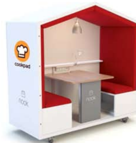
OPTIONAL – ADD LOGO Customer Co-branded Nook