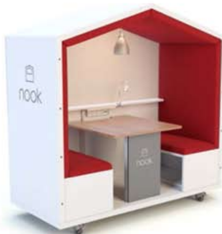
INCLUDED - Standard Nook Branding

This can be valuable to maintain the cleanliness of a space, to allow short-term sponsorship, to add corporate branding for events and to project a sense of brand ownership.